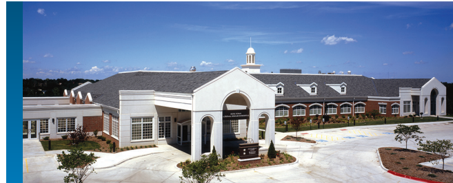
Boys Town National Research Hospital 14000-14040-14080 Boys Town Hospital Road Boys Town, NE 68010