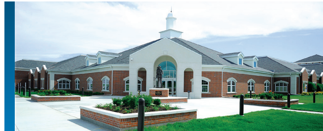
Boys Town Residential Treatment Center 14092 Boys Town Hospital Road Boys Town, NE 68010